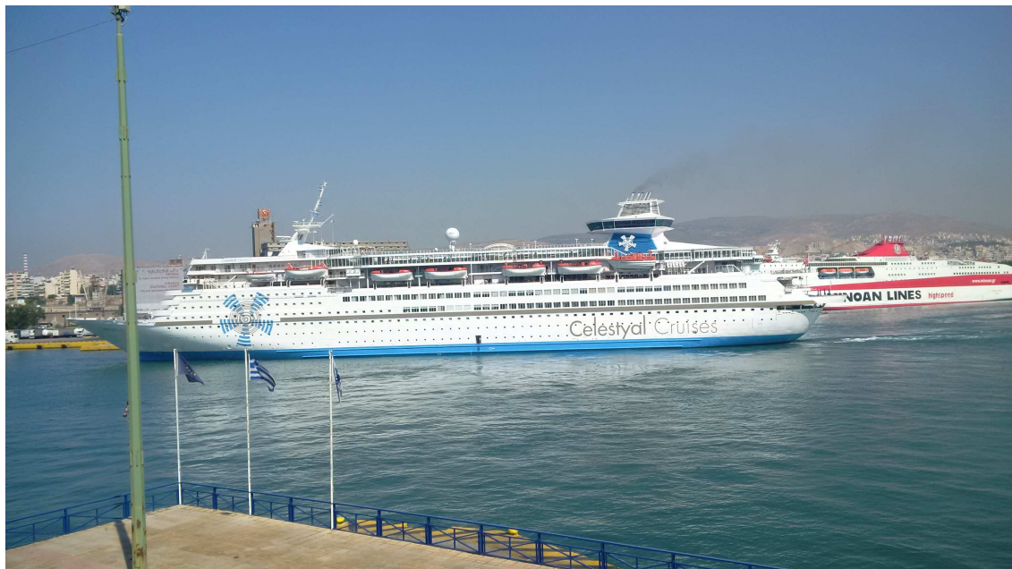
A cruise in which a FastPass kiosk could be installed for the demonstration

Altogether, the meeting led to a fruitful discussion and as a result, a clear roadmap on how to proceed with the FastPass Sea Border demonstrator in Piraeus has been created.