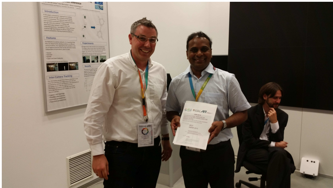
Pictures of the panel session and the audience ( upper left and right). Below, a picture of the winner of the ISBC Best Paper Presentation